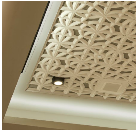
Crescent Path Acoustics Series