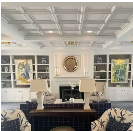
Executive Coffered Acoustic

Headquartered in Milwaukee, WI, Above View Inc. is a trusted source for 2' x 2' plaster and glass fiber (GRG) artisan ceiling tiles. Create a striking ceiling with one of 100 standard ceiling tiles, or your custom tile design! Made in the USA since 1984. Explore our website at aboveview.com for inspiration. We welcome inquiries at info@aboveview.com or 414-744-7118.