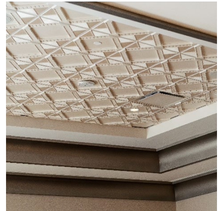
Deco 2 – Square Acoustic